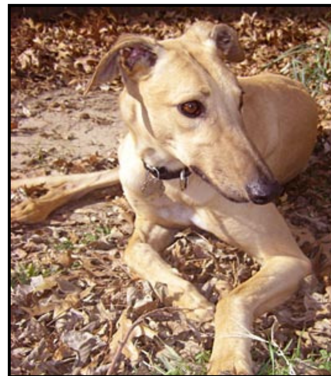
Skycam, 4 year old red fawn male – available for adoption